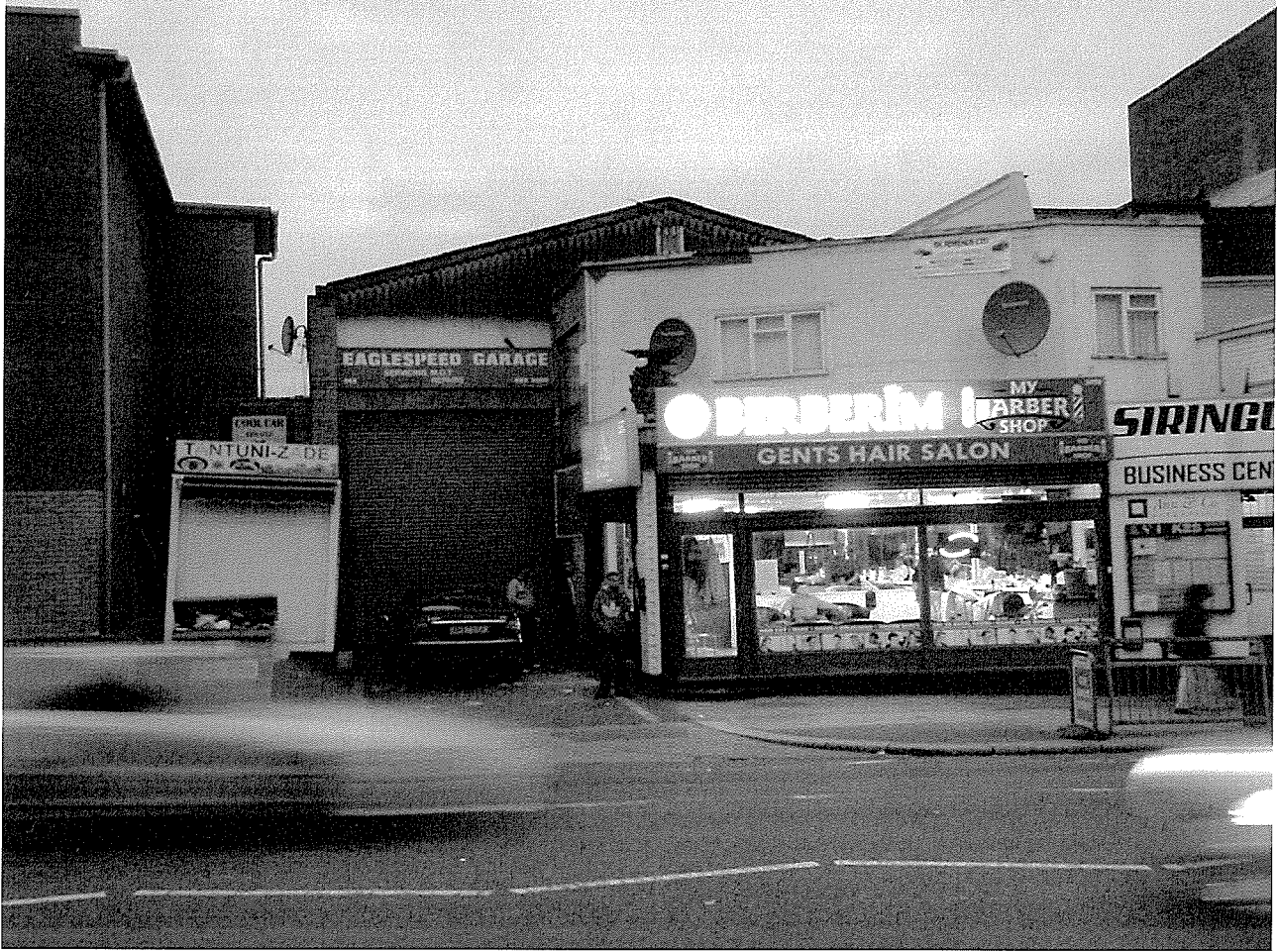
Front of premises