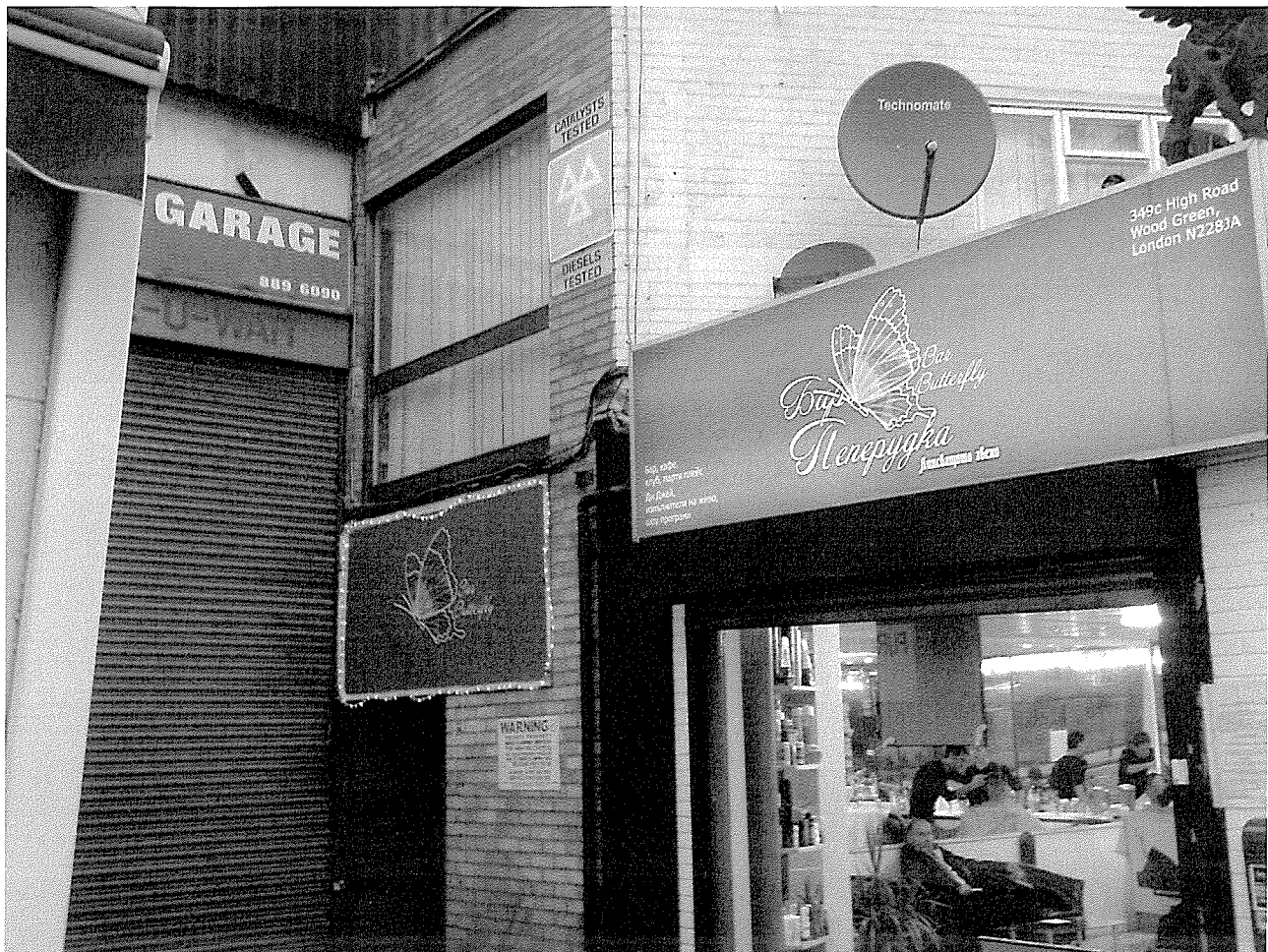
Front door way to bar, with barbers shop at front of premises. Barbers shop is intended to be closed down and bar premises extended to front of building, with snooker tables in what is now the barbers shop.