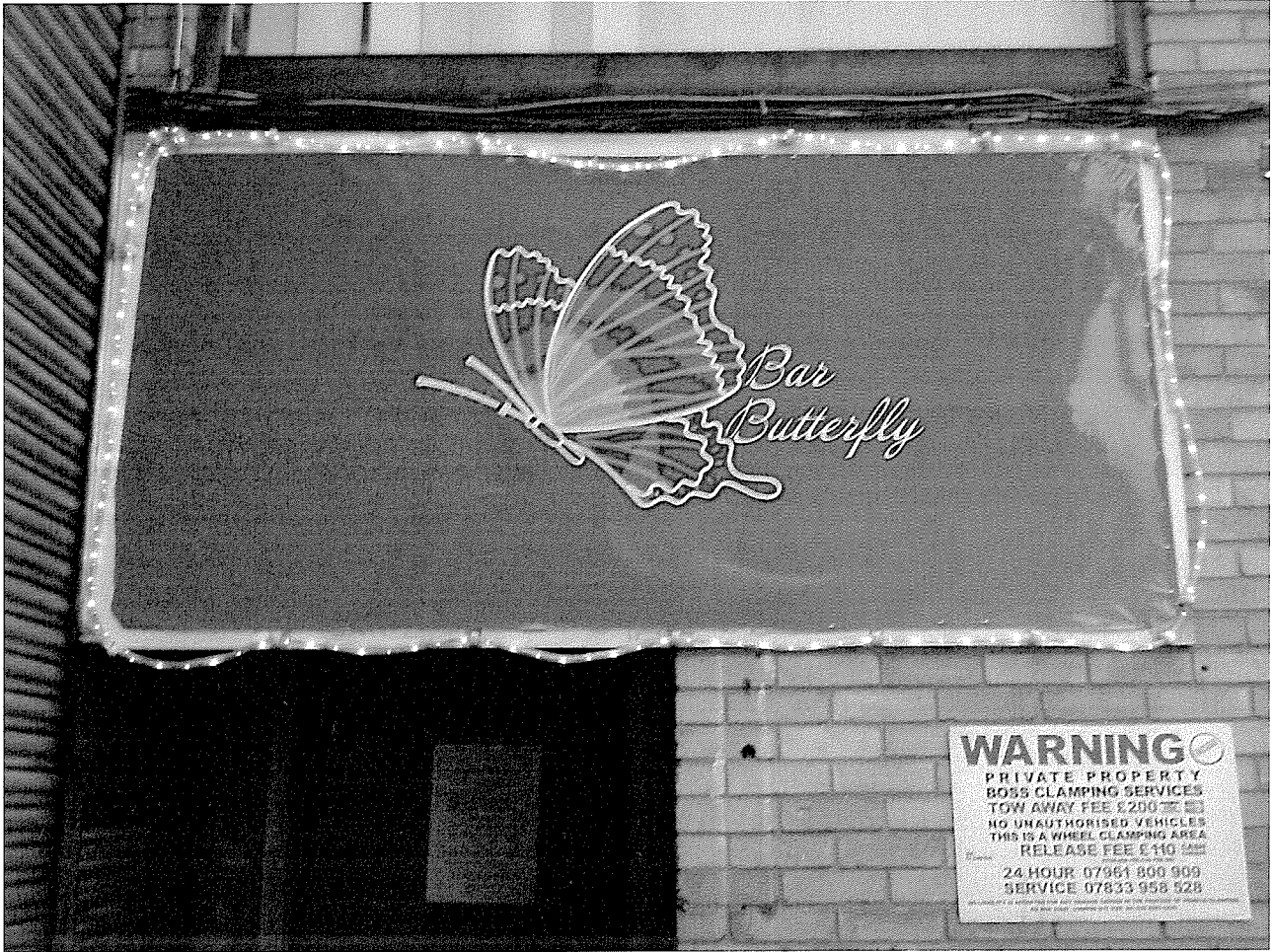
Signage above the entry doorway.