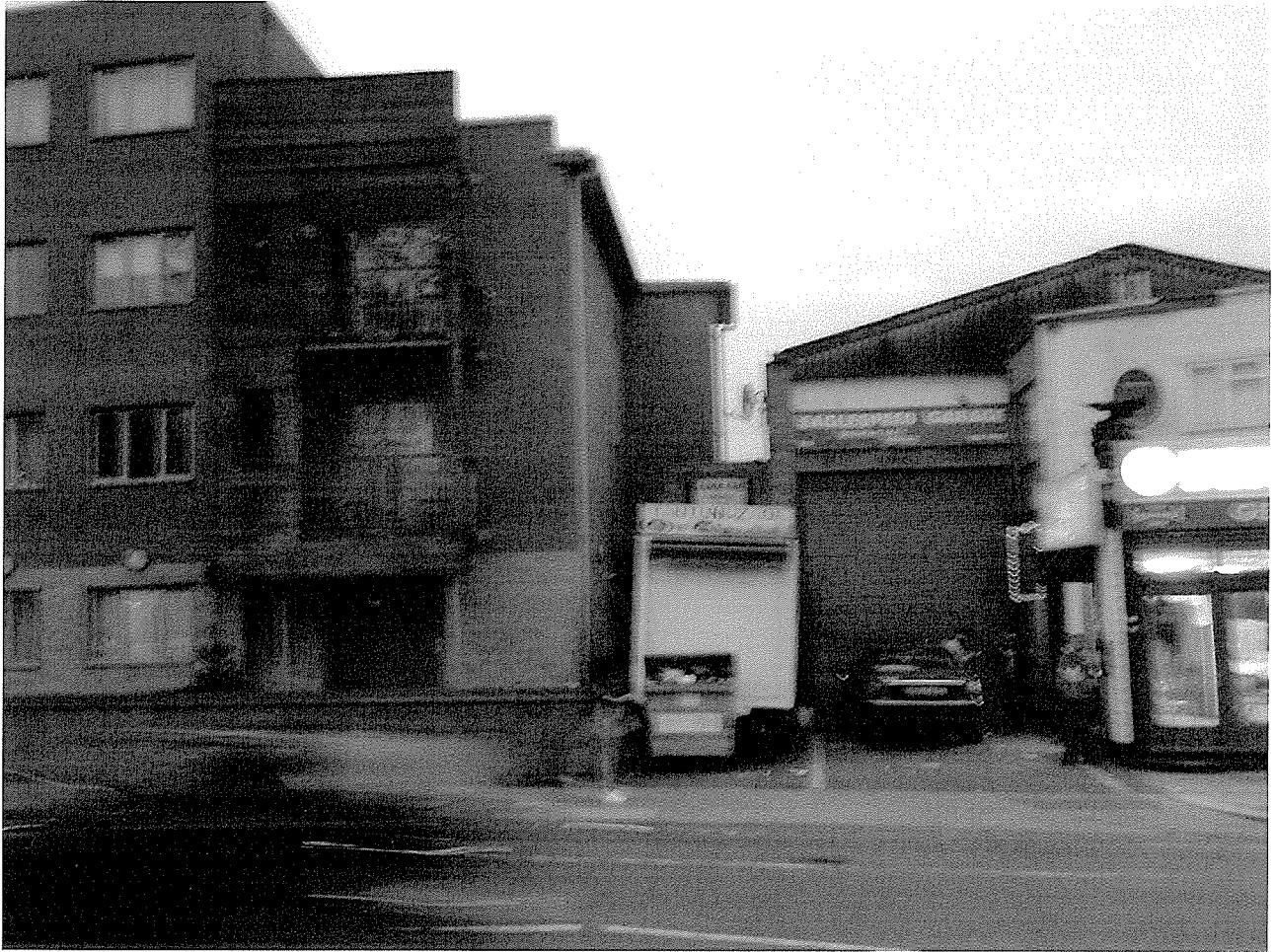
Flats to the left of the premises. (apologies for picture quality )